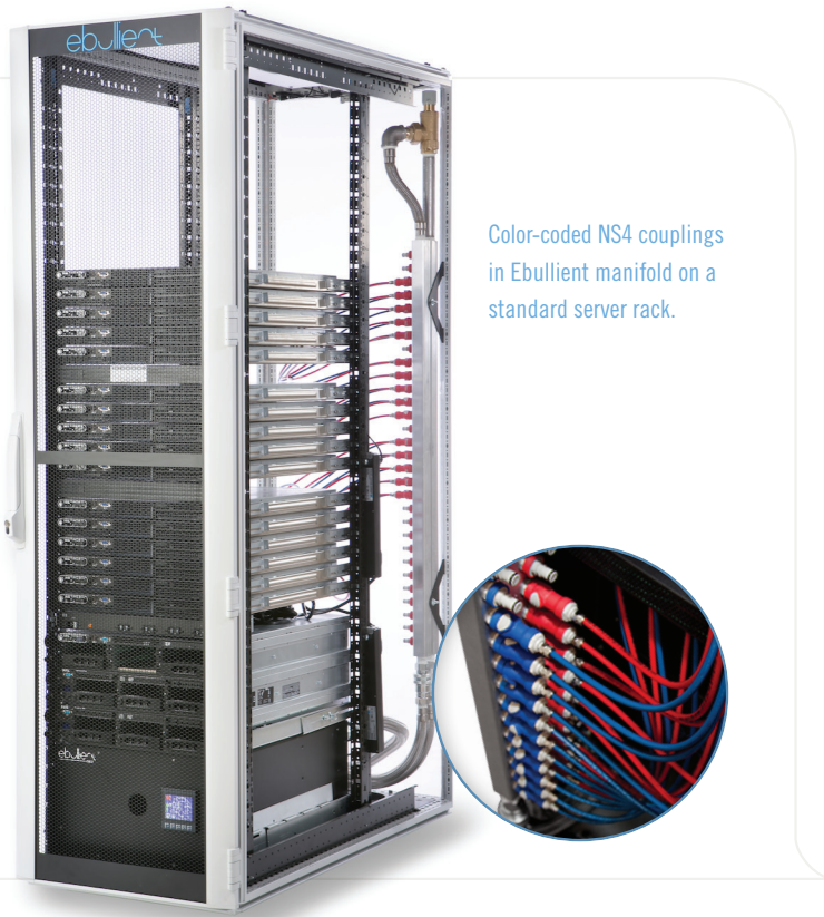
Color-coded NS4 couplings in Ebullient manifold on a standard server rack.

Ebullient DirectJet™ cooling modules replace air-cooled heat sinks and sit atop the processors within the server. Quick disconnect couplings attach the module's flexible tubing to manifolds mounted on the server rack. A pump directs fluid through the system, which draws heat from the CPU or GPU as it circulates back out. The modular, scalable system delivers quiet, reliable, consistent cooling and enables rapid installation in any server, regardless of make or model.