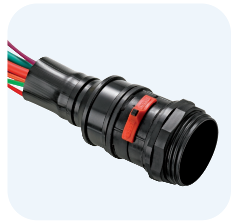
Figure 3: Multiple fluid lines can be color-coded or even vary in material or tubing size to fit the application.

6. Implement gravity fed plumbing with shutoff valves: Why specify expensive and complex pumps onto the instrument when gravity can feed on-board fluidics? Using couplings with shutoff valves eliminates the risk of spilling fluids during inverted