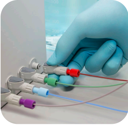
Figure 5: Quick disconnect couplings can be color-coded or physically keyed to ensure the correct connections are made every time.