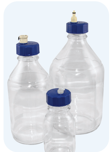
Figure 4: Eliminate the potential for spills when changing fluid by threading quick disconnects directly in standard laboratory caps.

installation and ensures 100% evacuation of fluids from the bottle or reservoir. In this setup, non-spill valves minimize air inclusion (the volume of air introduced into the system each time the coupler is connected.) Venting to the bottle can easily be accomplished with a similar dip-tube