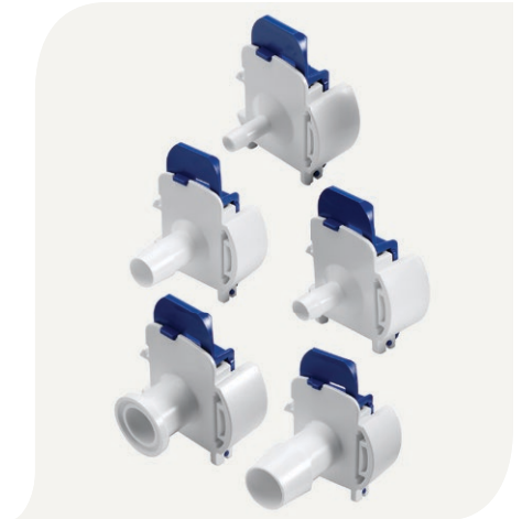
CPC's interchangeable AseptiQuik® genderless connectors enable tubing transitions between tubing of different sizes, from 1/4" to 3/4" flow.

Just as single-use technology emerged in response to market demands, so too have genderless single-use connectors. Systems designers and processors have maximized the benefits of single-use and hybrid processes — those of increased flexibility, faster changeovers and reduced costs. Now the bioprocessing industry can also benefit from the reduced components complexity afforded by genderless connectors.