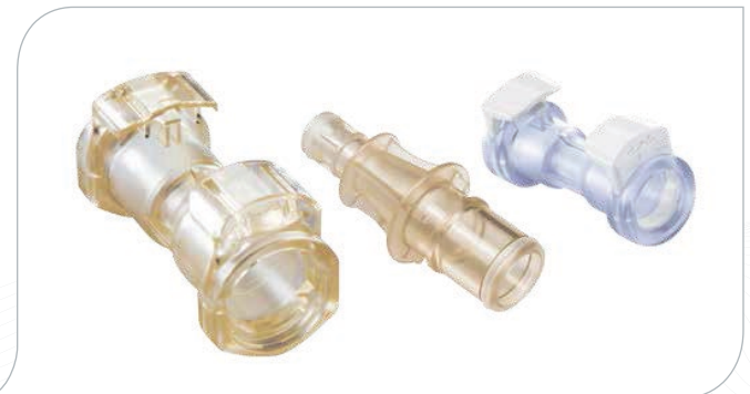
Figure 1: MPC/MPX back-to-back adapters give end users the flexibility of connecting single-use systems that feature identical coupling connections at the end of their tubing.

Any time a component requires a specific mating component, finished-goods inventory needs can more than double, or even triple. As an example, consider an assembly as simple as a basic transfer line with sterile connectors on each end. There are three possible configurations depending on the application set-up: a female-to-male version, a male-to-male version and a female-to-female version (see figure 2).